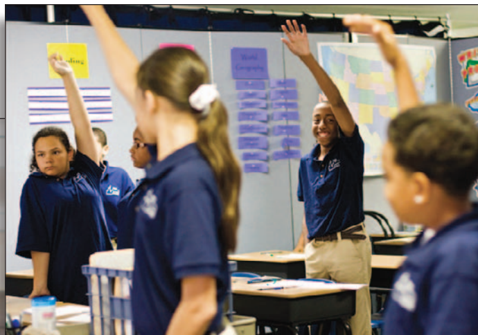
PHOTOGRAPHY / COLUMBUS COLLEGIATE ACADEMY

In March of 2010, Columbus Collegiate Academy was named one of only nine charter elementary schools nationwide to receive the silver EPIC award from New Leaders for New Schools for dramatic gains in student achievement.