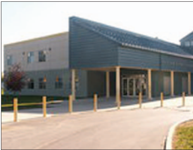
PHOTOGRAPHY / DAYTON LEADERSHIP ACADEMIES