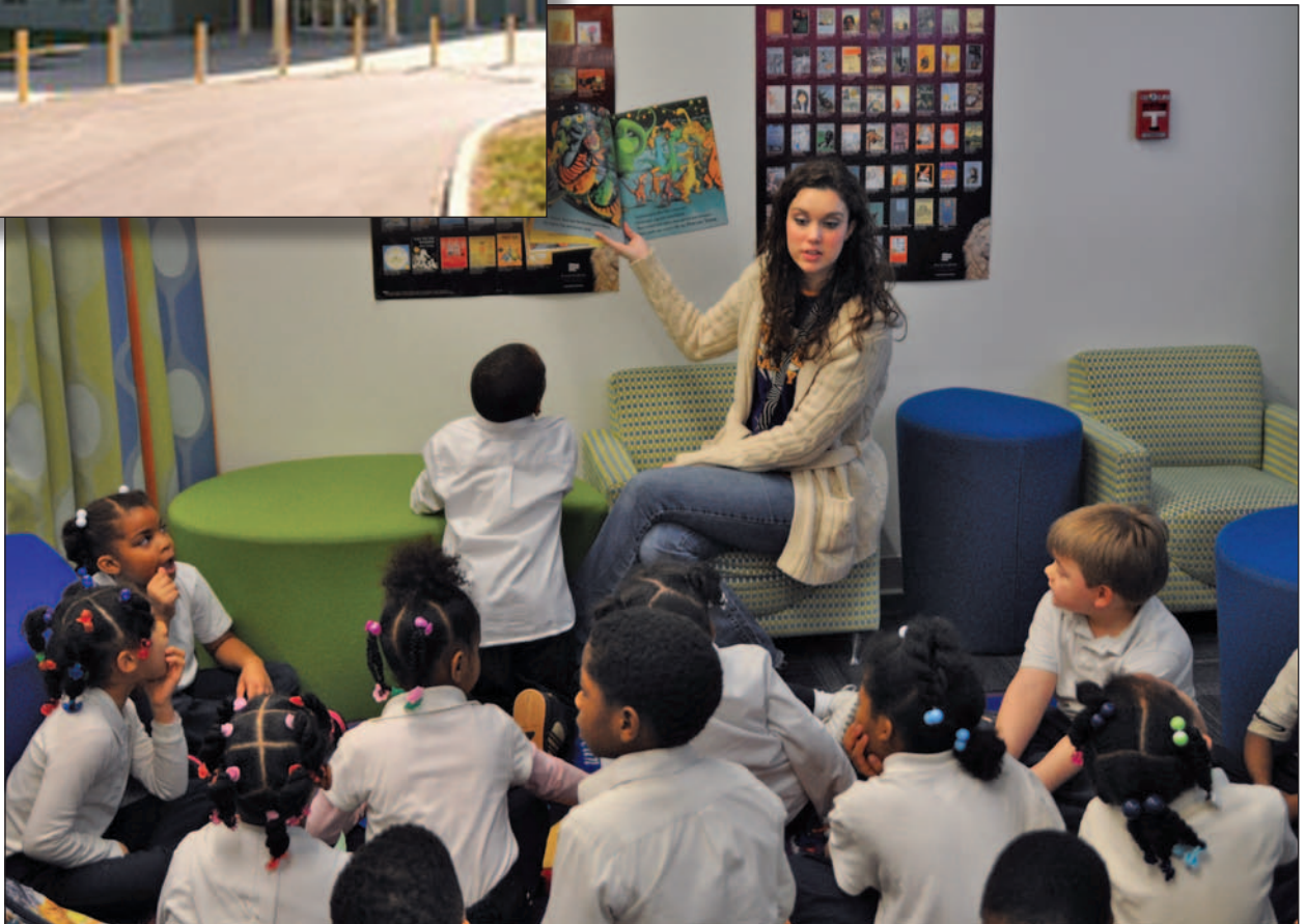
Dayton Leadership Academies, under the management of Edison Learning, have remained among the state's higher-rated charters.

Besides keeping charter schools on short fiscal rations and “taxing” them for sponsorship, Ohio imposed onerous and disruptive reporting requirements. For example, charters had to report their student counts to the state every month while districts did so only twice a year. A charter school’s monthly revenue could suddenly drop by several thousand dollars if, for example, a mother lost her job