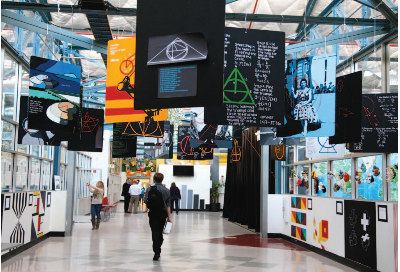
High Tech High is perhaps the most eye-poppingly technology-rich charter school in the country. Mixed-media art hangs from every wall, door, and metal roof beam, and gee-whiz technology is everywhere.

artificially intelligent assessment and learning system.” ALEKS, which runs on computers on the periphery of a 9th-grade classroom, provides teachers with detailed diagnostics, helping them to focus on the areas where students are struggling, and lets students take lessons at their own pace. A student logs on to ALEKS and begins by taking an adaptive assessment, each question chosen on the basis of previous answers. With this information, ALEKS develops a snapshot of a student’s knowledge in a given content area, recognizing which topics