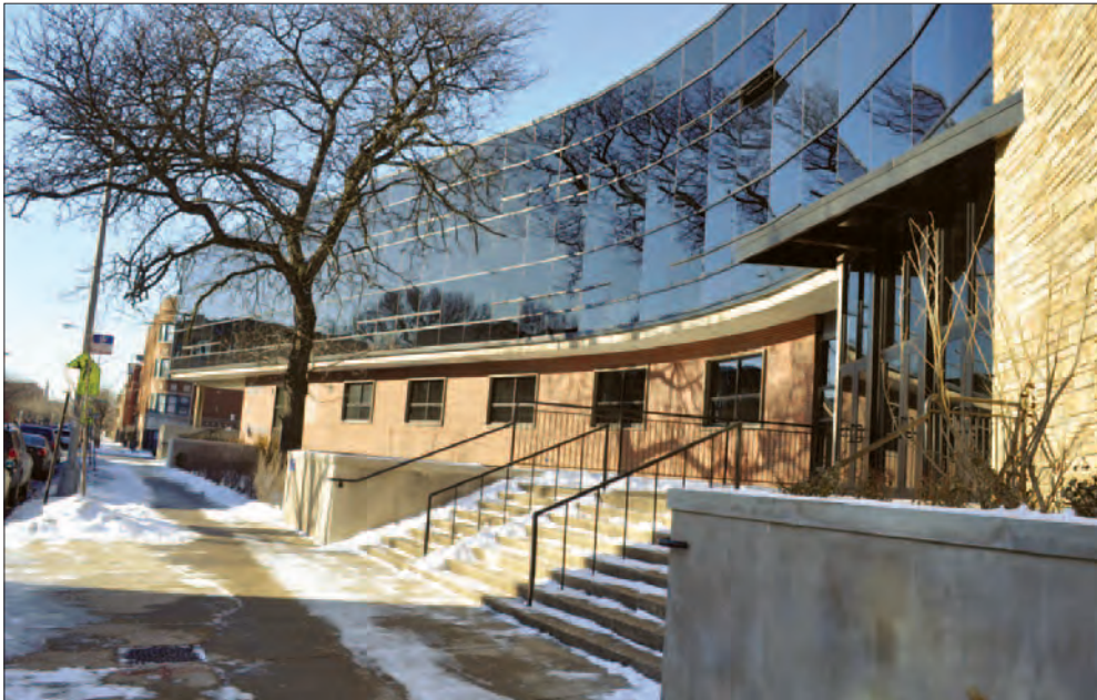
In 2009, Austin Circle Rock outperformed the other Austin neighborhood schools on the composite Illinois Standards Assessment Test.