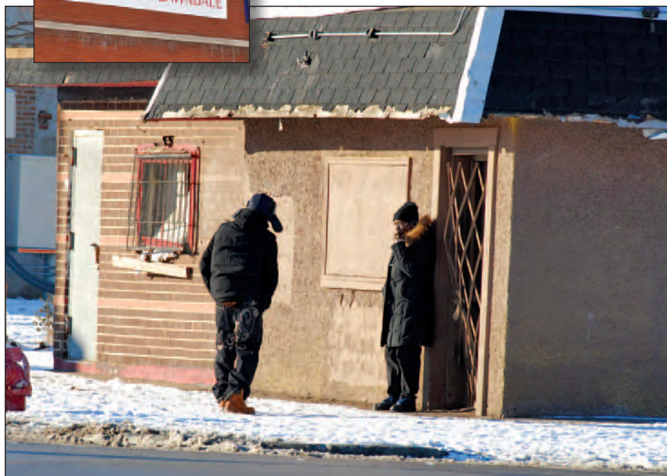
At the time of the 2000 census, approximately 10,000 adult males from the North Lawndale neighborhood were in prison.

strategy that Duncan initiated in Chicago and would bring to his job as secretary of education in the Obama administration: improve some schools by closing them, then reopening under new management.