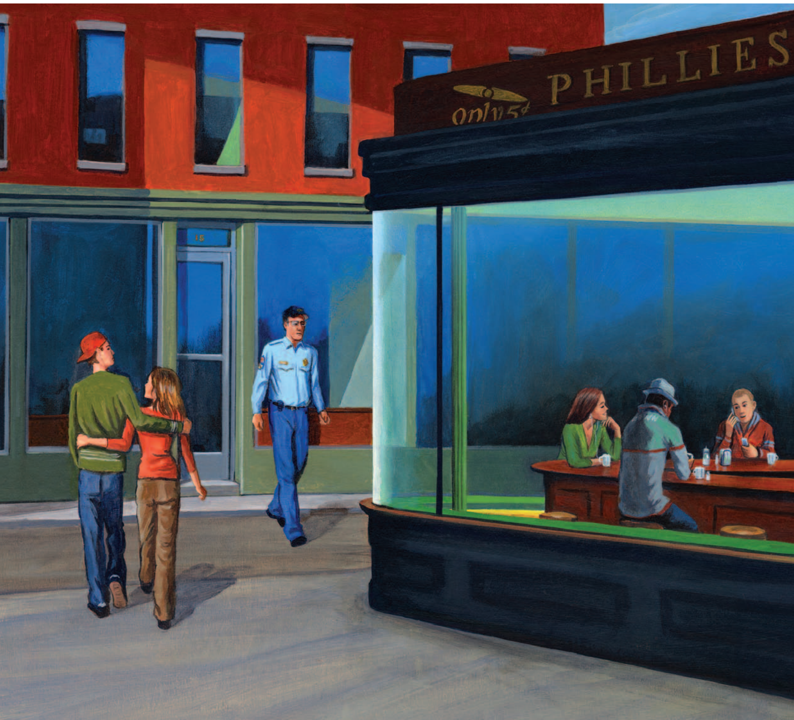
ILLUSTRATION / JT MORROW ADAPTATION OF EDWARD HOPPER'S NIGHTHAWKS