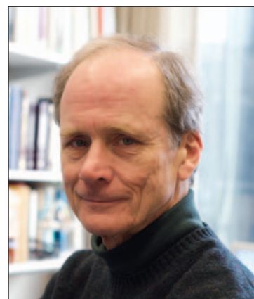
Psychologist Edward Deci co-authored self-determination theory

Middle schools, desperate to keep order in a hothouse of surging hormones, slap on tighter rules at the very time that kids crave more independence. They also tend to be larger and have many more stu-