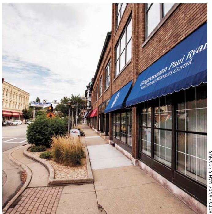
Janesville rejected the Budget Repair Bill and chose to ride out an existing contract, a decision that led to the elimination of 60 full-time jobs.

Act 10 empowered school districts to make significant changes in order to customize operations at the local level. It limited the amount of influence educators and their unions had over high-level decisions; it also may have helped some school boards better engage with their staff members.