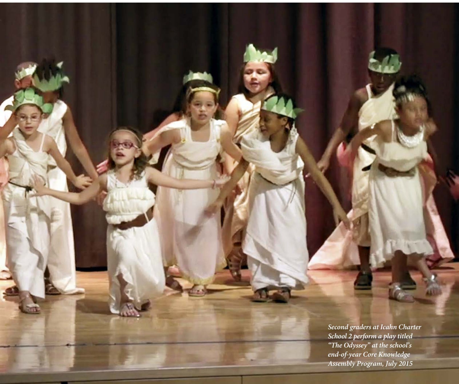
Second graders at Icahn Charter School 2 perform a play titled “The Odyssey” at the school’s end-of-year Core Knowledge Assembly Program, July 2015

(a type of traditional Mexican dress). I nearly fainted when a girl correctly pronounced the ancient Aztec name for Mexico City, Tenochtitlán (tē-nōch-tē-tlān).