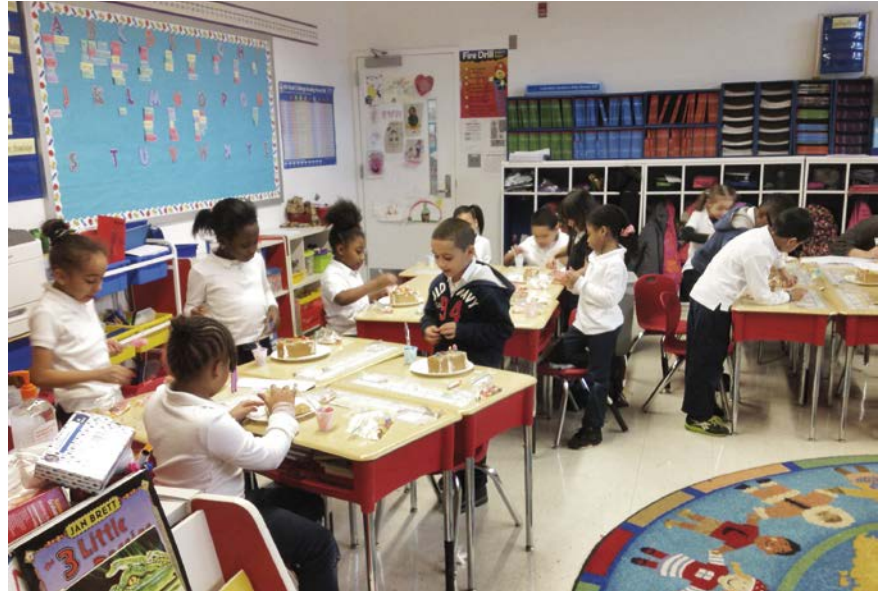
Second graders study westward expansion, creating their own covered wagons out of edible materials as they learn about how pioneers traveled.

At Icahn, teachers tend to be a bit more experienced than at the typical charter, reflecting Litt’s conviction that “teaching should be a real profession, not something you dabble in for