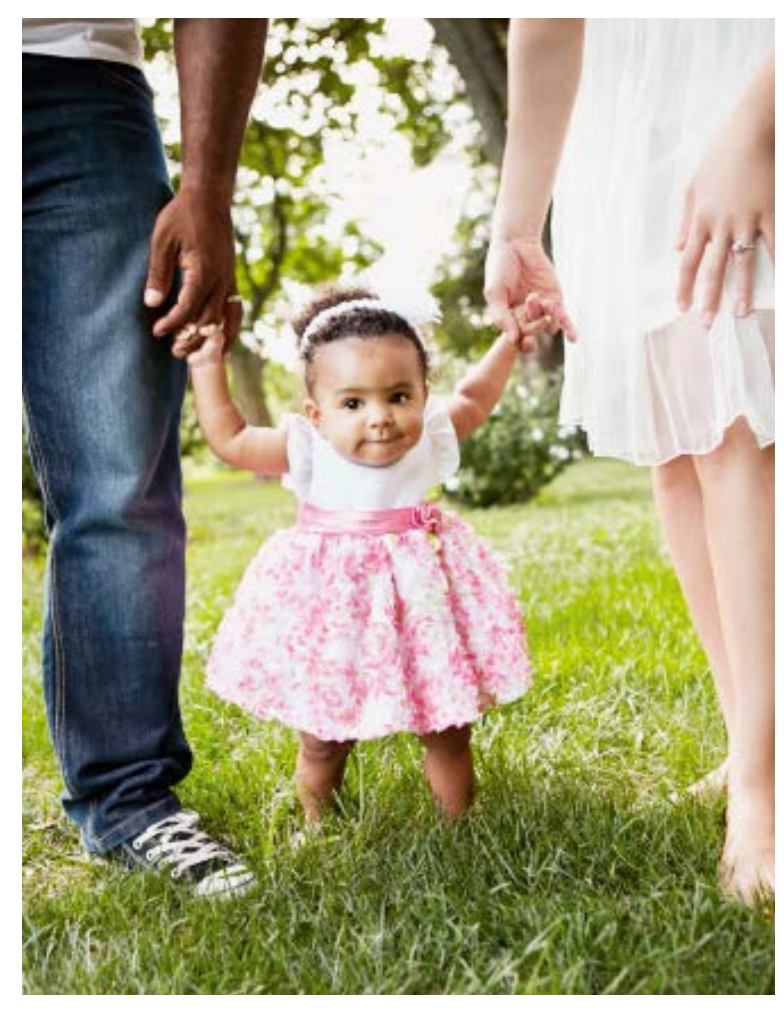
During the pre-pre-K period, which spans infancy through toddlerhood, development is rapid and the home environment looms large. The quality of parenting matters a lot.

In Generation Unbound , I show that a large fraction of young adults are "drifting" into sex and parenthood without having thought very much, if at all, about these questions. About half of new parents under 30 are unmarried (although