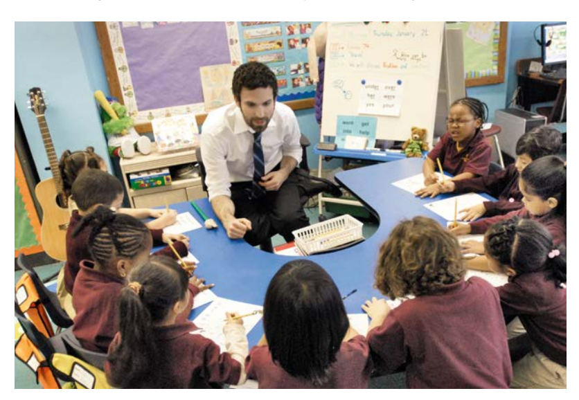
Parental choice and control over children's education foster the parental engagement and self-reliance that children require.

I do not deny that single-parent families may under certain circumstances be much better for a child's well-being than the two-parent option available. Nor do I recommend draconian measures that would reverse the Great Society, though it must be said that none of those programs have resulted in noticeable reductions of official poverty levels or the level of African American and Hispanic male unemployment. What is needed is a redesign of these programs so that marriage is rewarded and families are empowered. Despite the celebration of alternative lifestyles, most people, including low-income individuals, hope for and seek marriage and stable families. Even adolescents have arranged their lives in such a way so as not to give birth