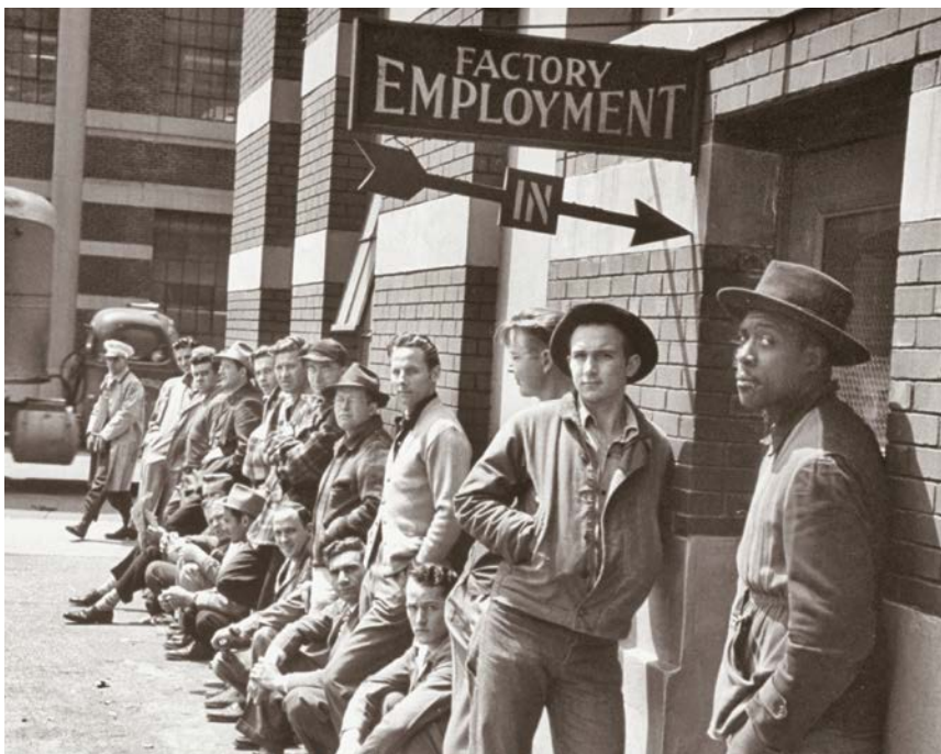
Until the late 1950s, unemployment rates and welfare application rates had risen and fallen together. But starting in the late '50s, welfare rolls increased even when unemployment was low and the economy was strong.

The latter element in particular—the importance of the family to the health and flourishing of society—has been controversial in the half century that followed Moynihan’s report. Roughly halfway through that period, in 1992, Moynihan himself took up that controversy in a speech delivered at the University of Chicago (and later reprinted in the Public Interest ). He was blunt. Despite President Johnson’s personal interest in his arguments, Moynihan said, the years that immediately followed his report—the era of the Great Society—brought an approach to social science and to public