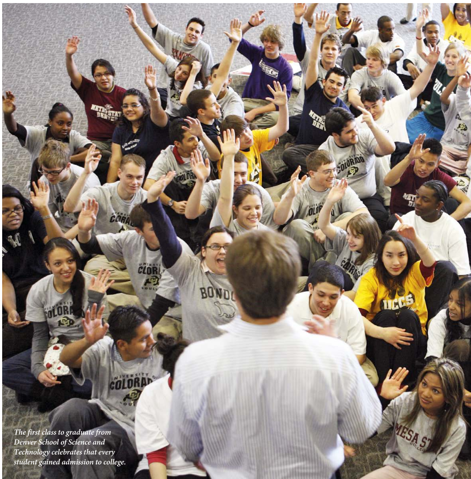
The first class to graduate from Denver School of Science and Technology celebrates that every student gained admission to college.