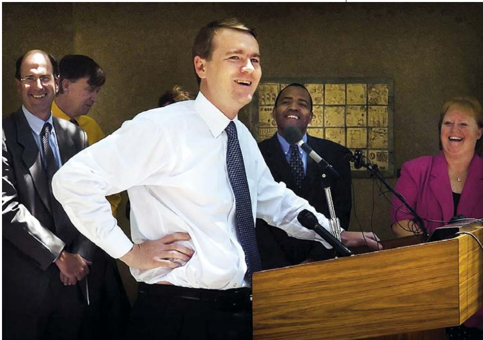
Michael Bennet, selected as superintendent of the Denver Public Schools in 2005, had previously turned around failing companies for a local investment firm.