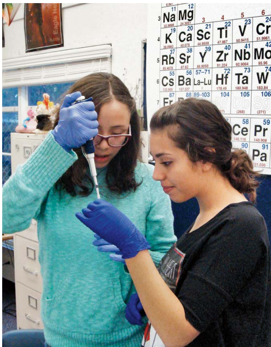
Ninth-grade students at Riverside STEM Academy work together in a STEM Research Methodologies class