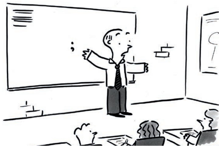
“Can anyone, anyone, tell me how a semicolon is used other than in emoticons?!”