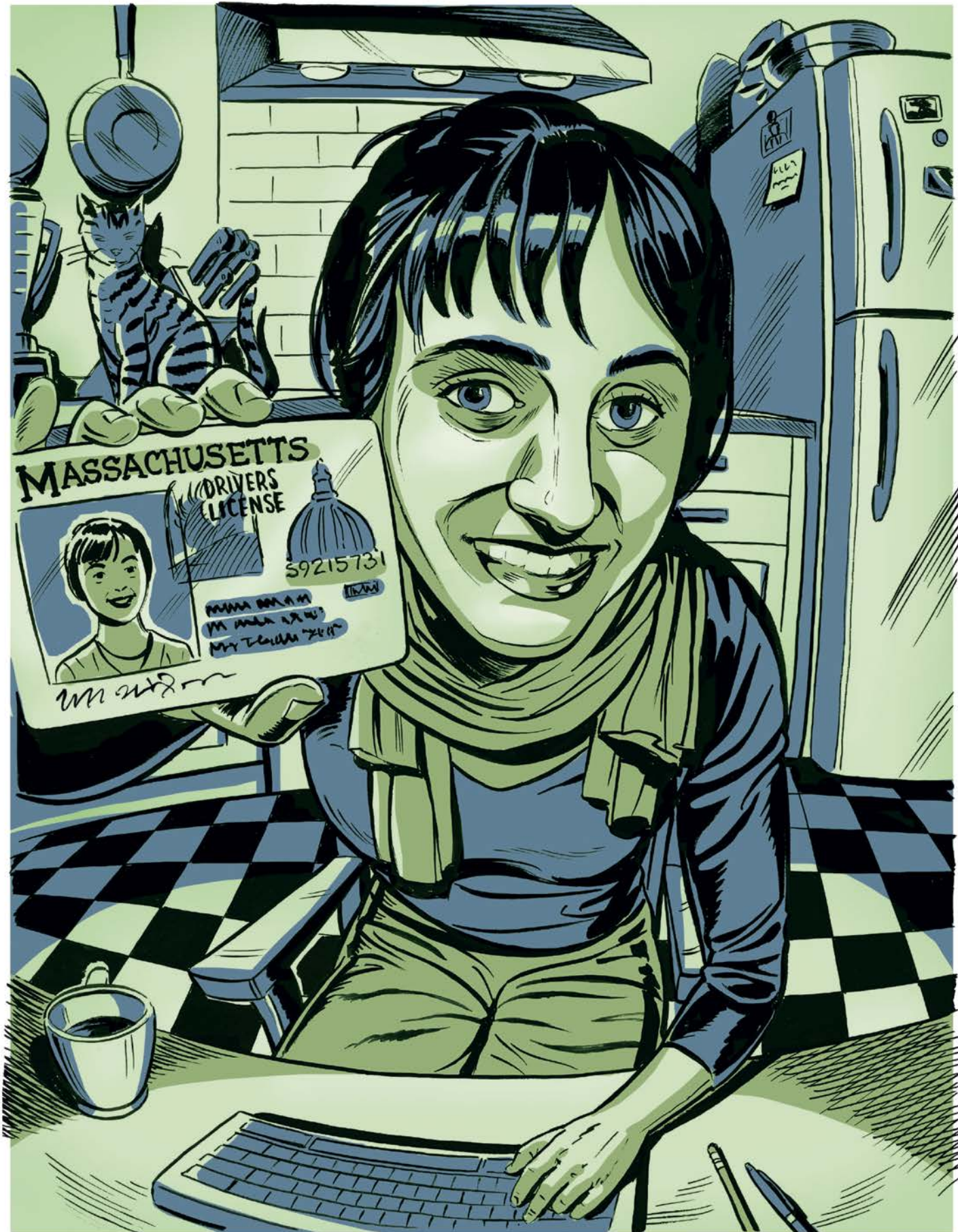
ILLUSTRATION / JONATHAN CARLSON