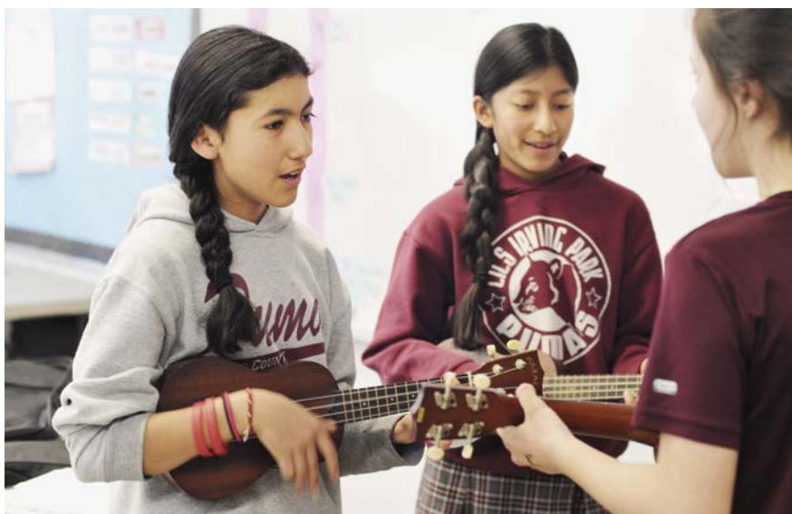
At CICS Irving Park, students learn the chords for the ukulele in music class and then work independently or in small groups to select and then learn a song to perform for their classmates.

Breo held multiple meetings to explain personalized learning to parents. Teachers liked the idea of mentoring students and holding “office hours” to give students extra help, but, like Pomeroy’s staff, they had trouble fitting it into the school day. “They were mentoring during breakfast, lunch, and PLT,” said Breo. “They came in during winter break to do office hours.” In February, Breo