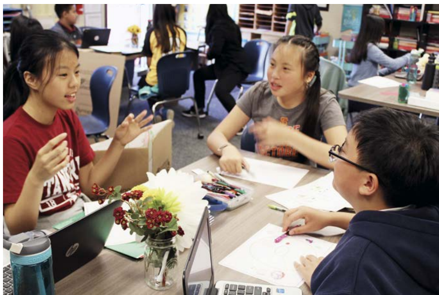
As they learn about social organization across different societies, Pomeroy students work on a project creating their own culture within a community.

To his delight, students "took ownership of their learning. They were getting things done on time, searching for information.