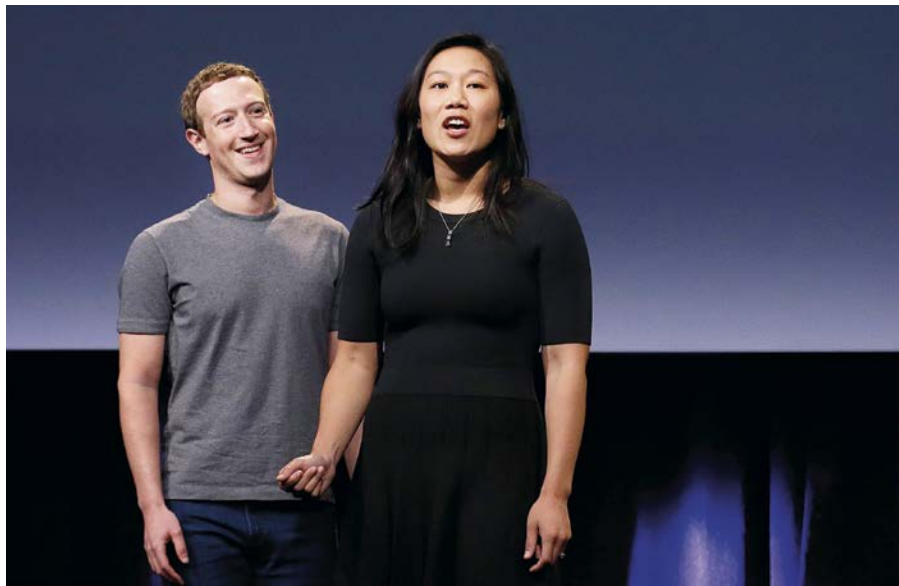
Facebook CEO Mark Zuckerberg and his wife, Priscilla Chan, were so impressed by Summit’s approach that Zuckerberg lent Summit a team of Facebook engineers and designers to help build the Summit Learning Platform.

This year, the Chan Zuckerberg Initiative—the high-tech couple’s foundation—will take over from Facebook as Summit’s engineering partner.