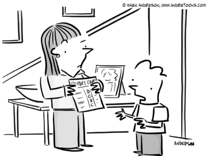
"I'm only getting a D in history, so technically I'm not doomed to repeat it just yet."