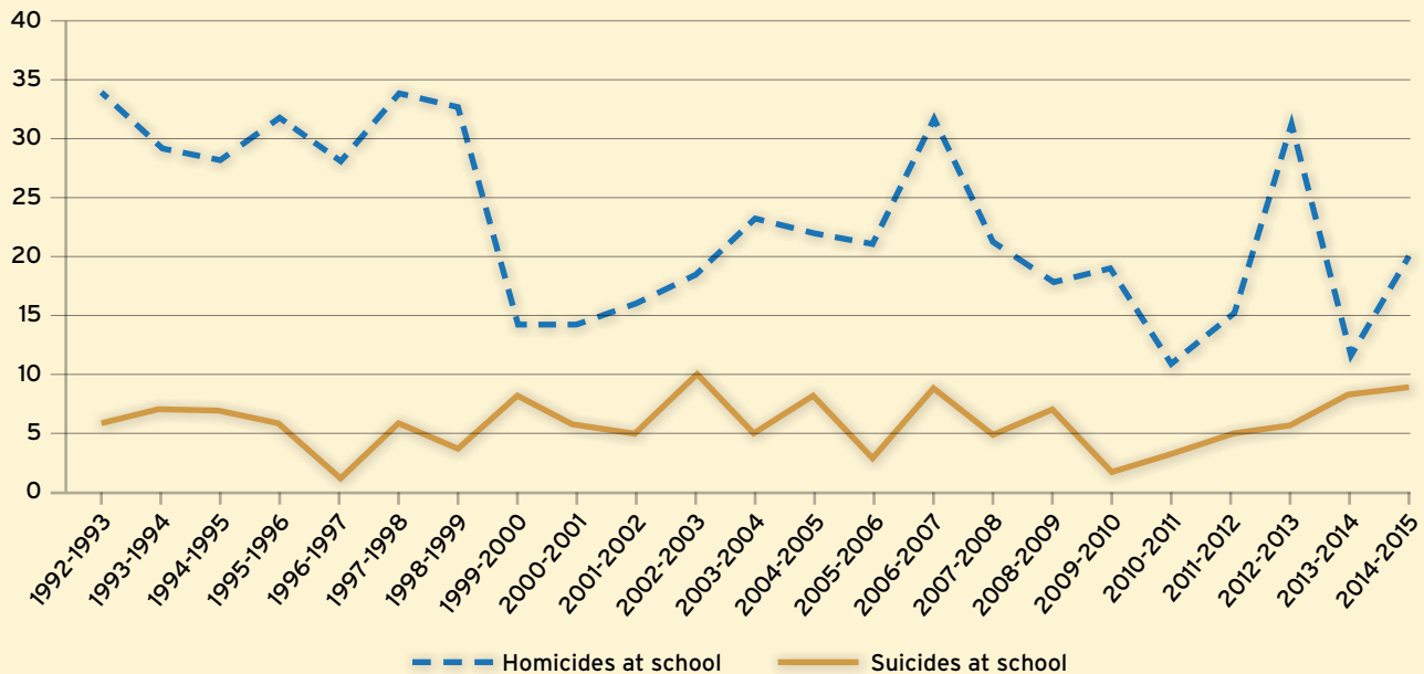
Number of homicides and suicides of youth ages 5-18 at school, by year