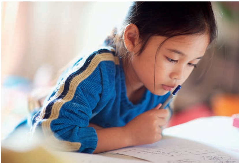
Across children's age groups, there is a strong and positive relationship between homework completion and self-regulatory processes.

Further, research demonstrates that low-income parents, recognizing that they lack the time to be in the classroom or participate in school governance, view homework as a critical connection to their children's experiences in school. One study found that mothers enjoyed the routine and predictability of homework and used it as a way to demonstrate to children how